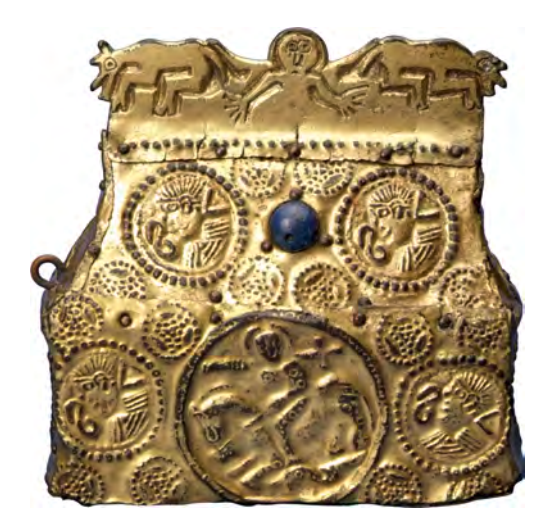
Bursa relic from Ennabeuren

The exhibition, sponsored by the state of Baden-Württemberg, offers an exciting tour covering 850 square metres. In addition to new excavation finds and valuable objects from the collections of our partners, visitors will also find a series of outstanding national and international objects on loan focusing on the key aspects of integration, migration, communication, faith and power.